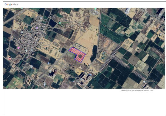
SITE SUPERIMPOSED ON GOOGLE IMAGE