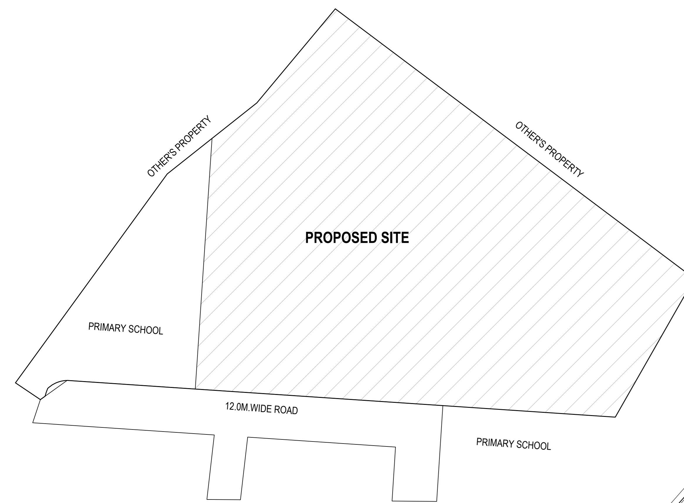
KEY PLAN (Scale - NTS)