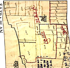
SAZRA PLAN SCALE: 1:100

કર્તાના નામ - 0-1, D-4, D-7, D-8 કાર્યકરના નામ - 396-27 જીલ્લા નંબર - 396-27