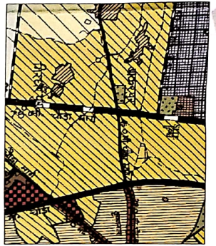
MASTER PLAN SCALE: 1:100