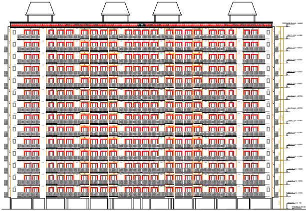
ELEVATION-1 (EAST & WEST SIDE)