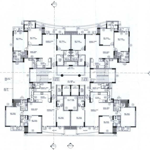
GROUND FLOOR PLAN, SCALE 1:100