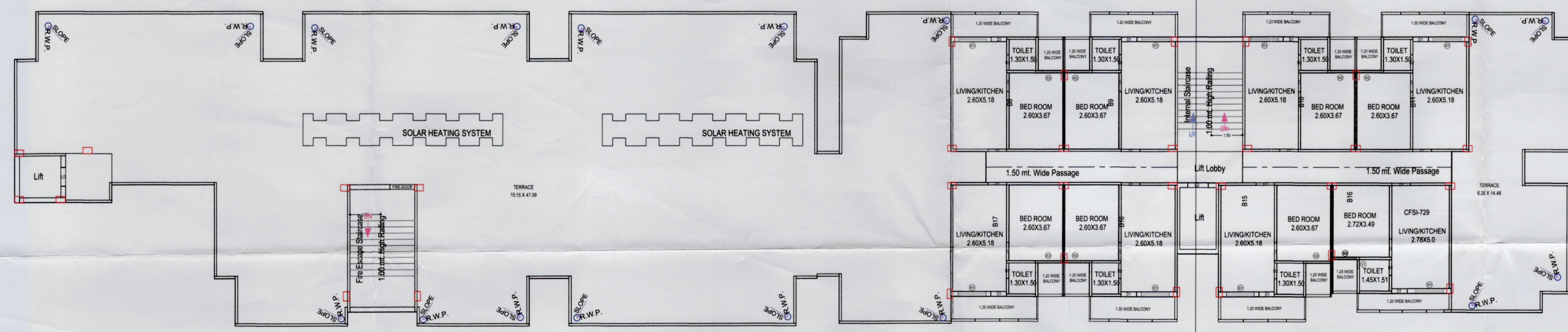
SIXTH FLOOR PLAN (Proposed) (SCALE 1:100)