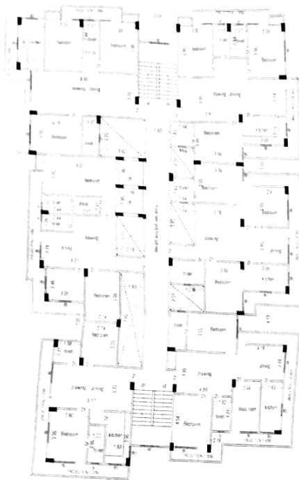
PROPOSED GROUND FLOOR PLAN UNITS = 6