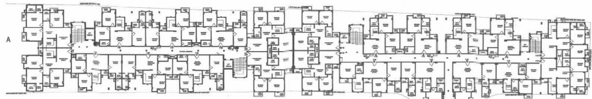
2ND-3TH FLOOR PLAN UNITS = 31 NOS. 31X2= 62NOS.