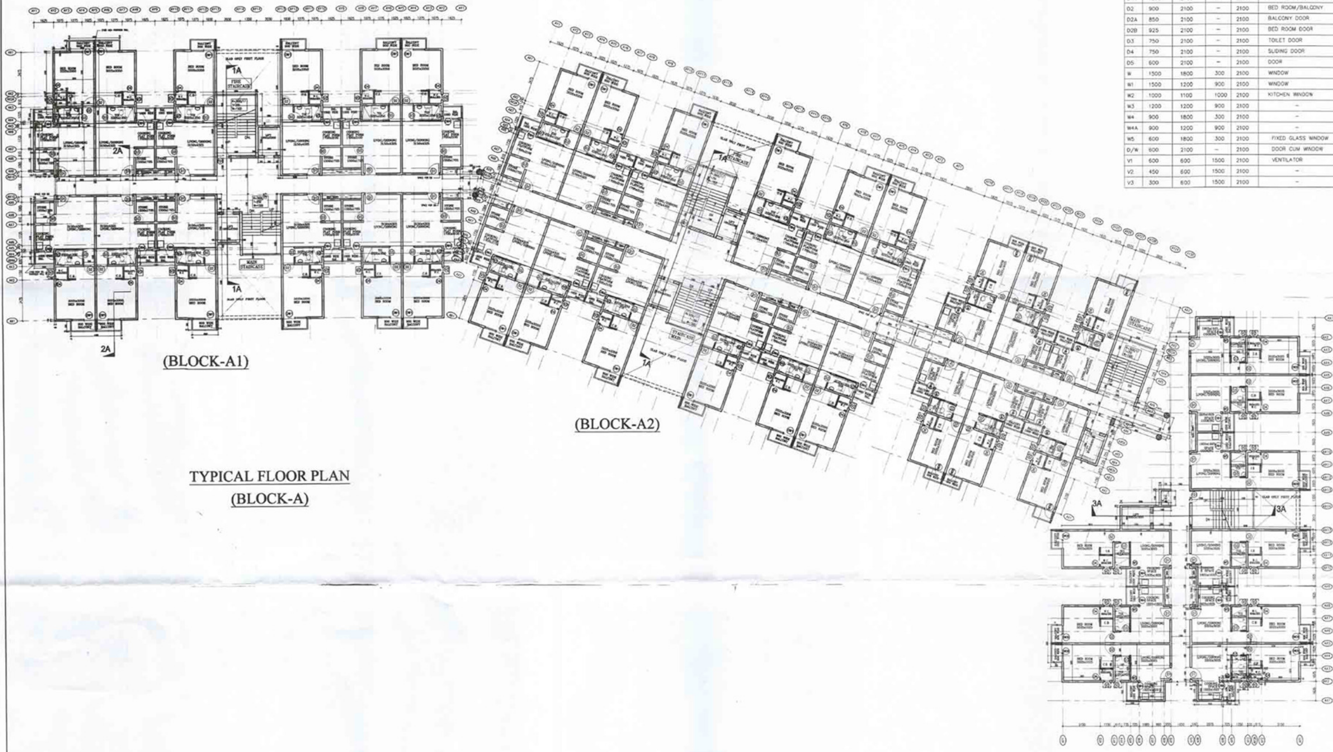
TYPICAL FLOOR PLAN (BLOCK-A)