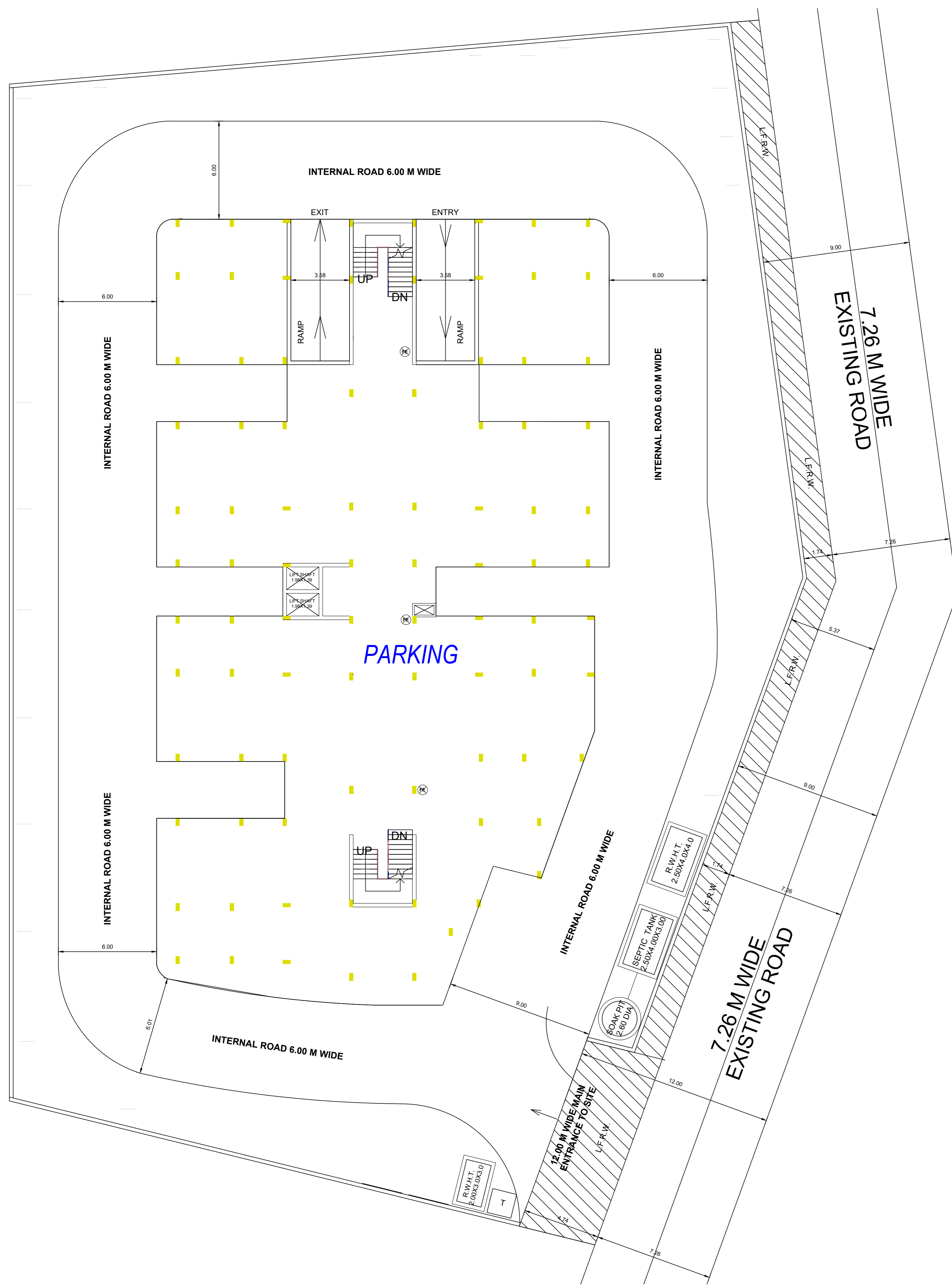
PARKING PLAN SCALE 1:150