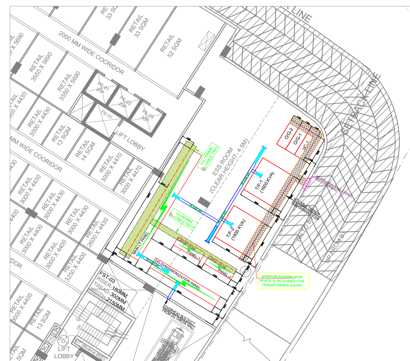
DETAIL C- ESS AT LOWER GROUND FLOOR