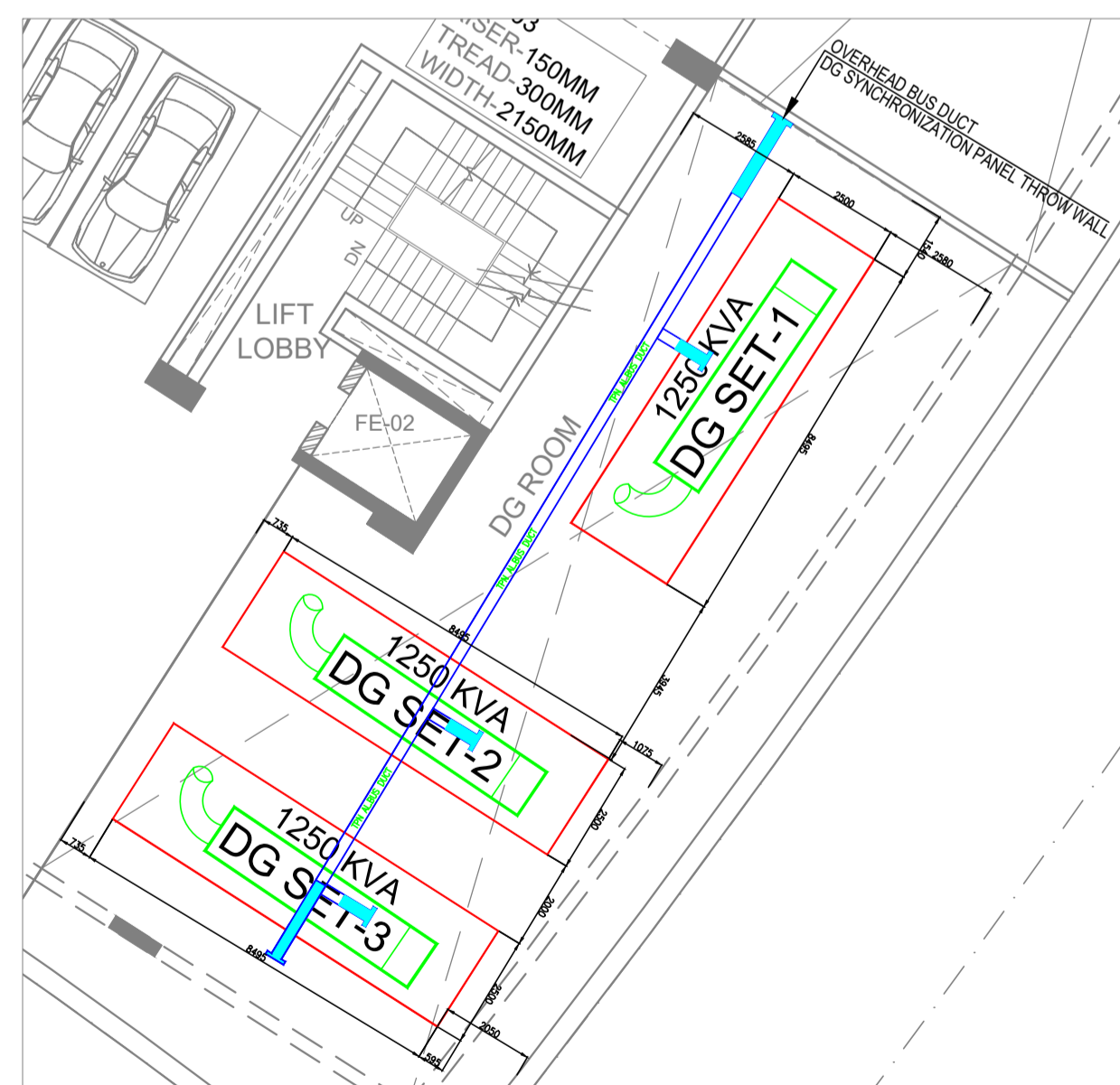
DETAIL A- DG AT BASEMENT-01 FLOOR