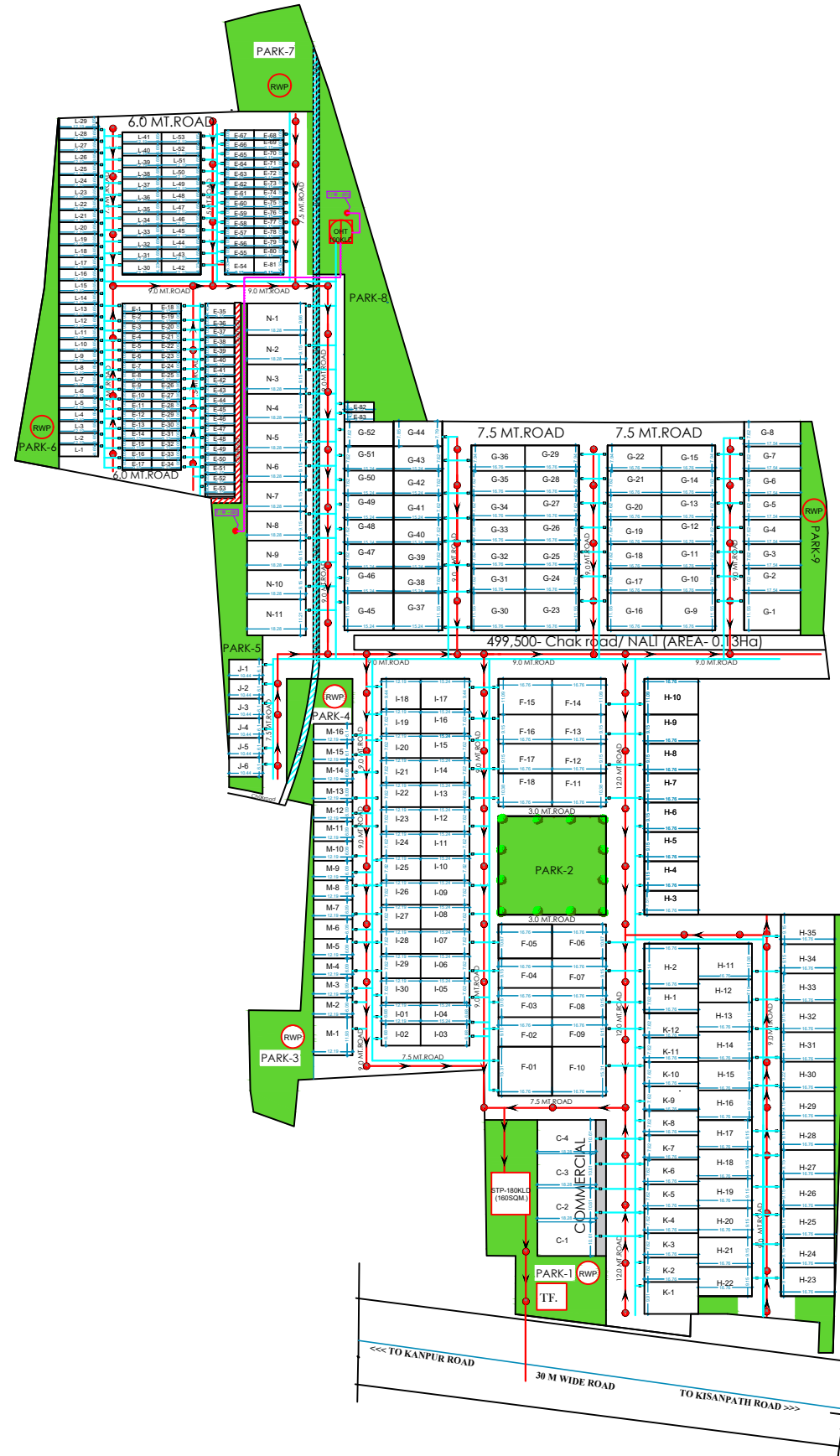
WASTE DISPOSAL PLAN SCALE 1:100