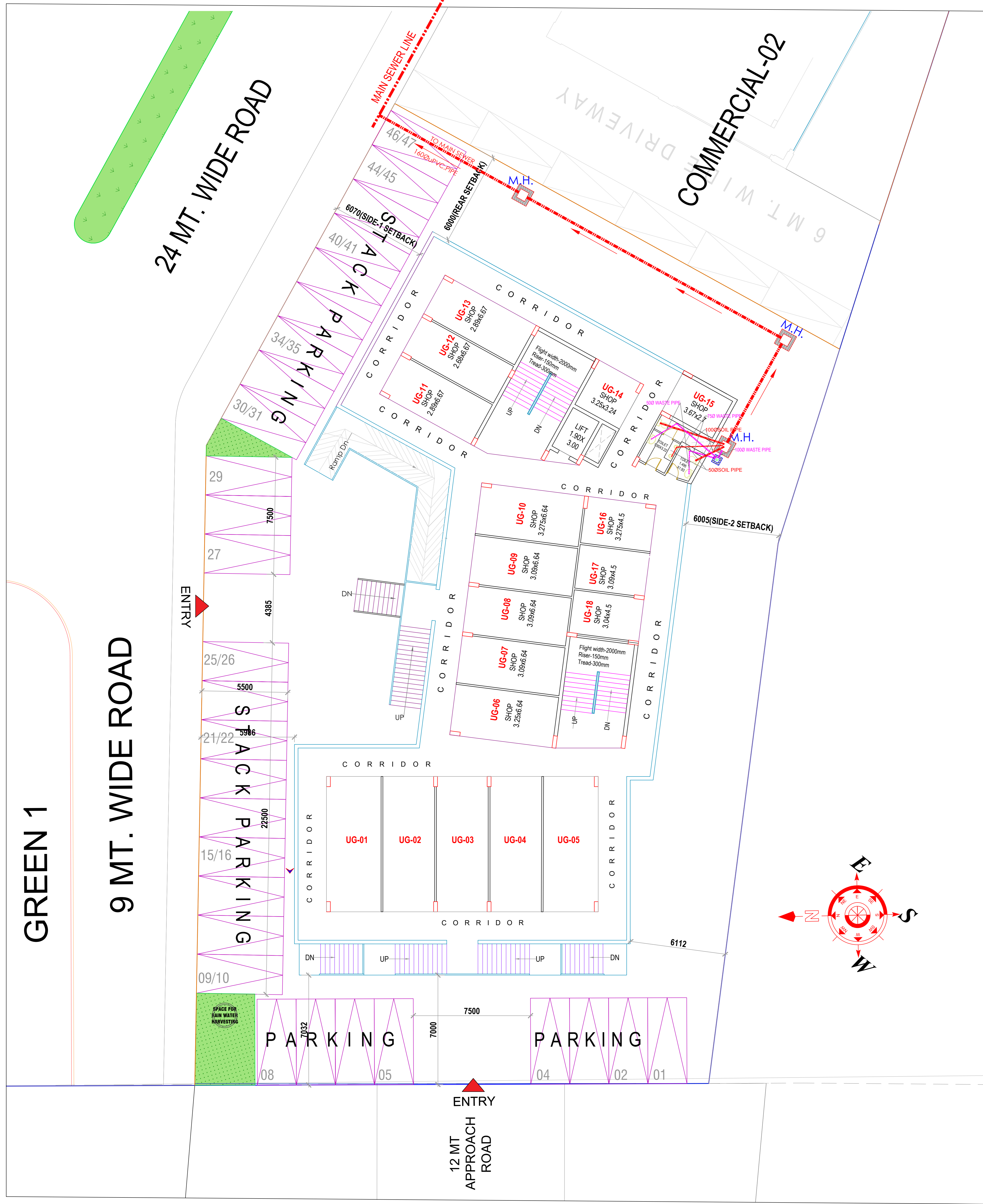
SEWER LAYOUT SCALE=1:200