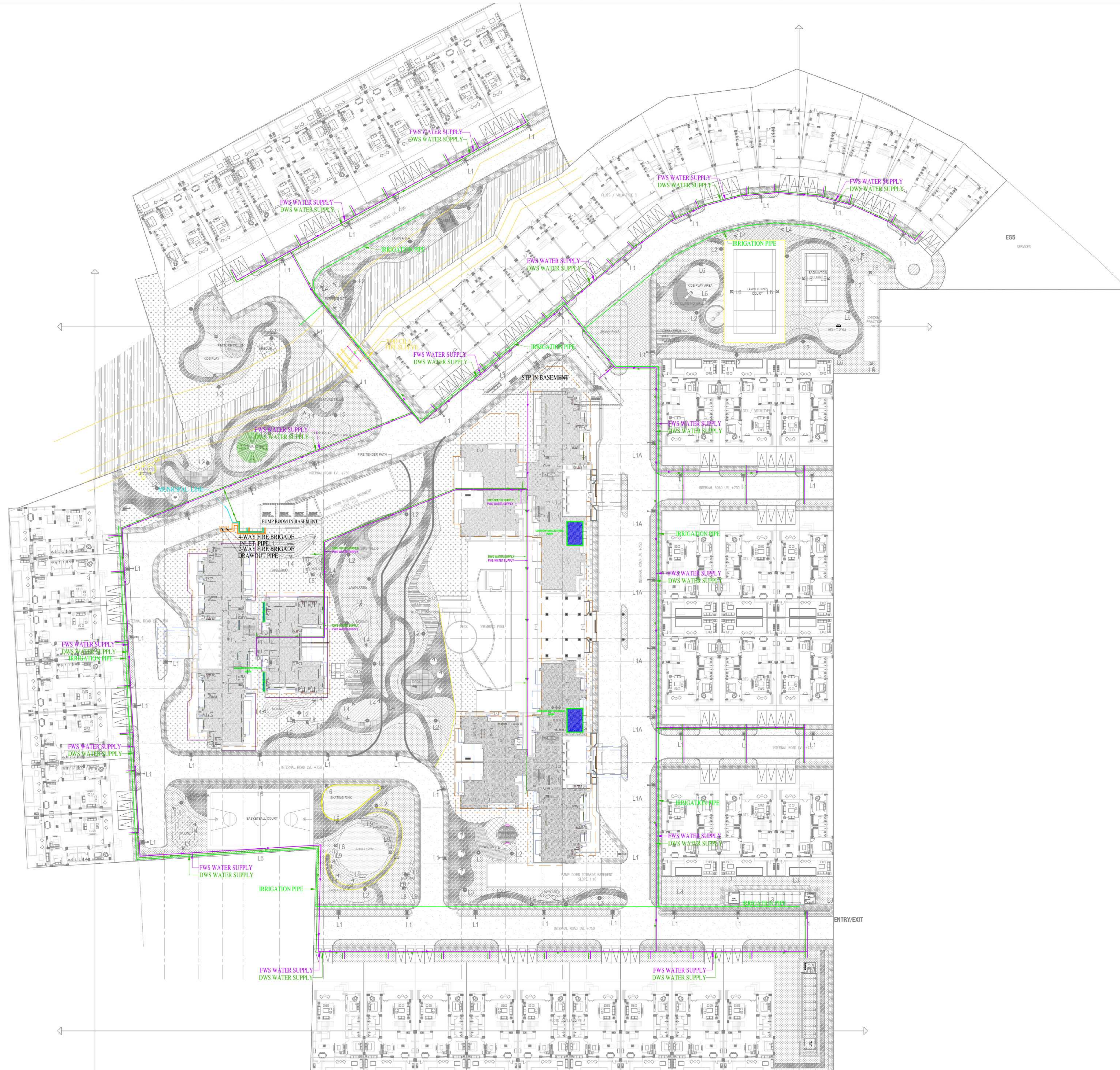
01 LIGHTING PLAN Scale: 1:500