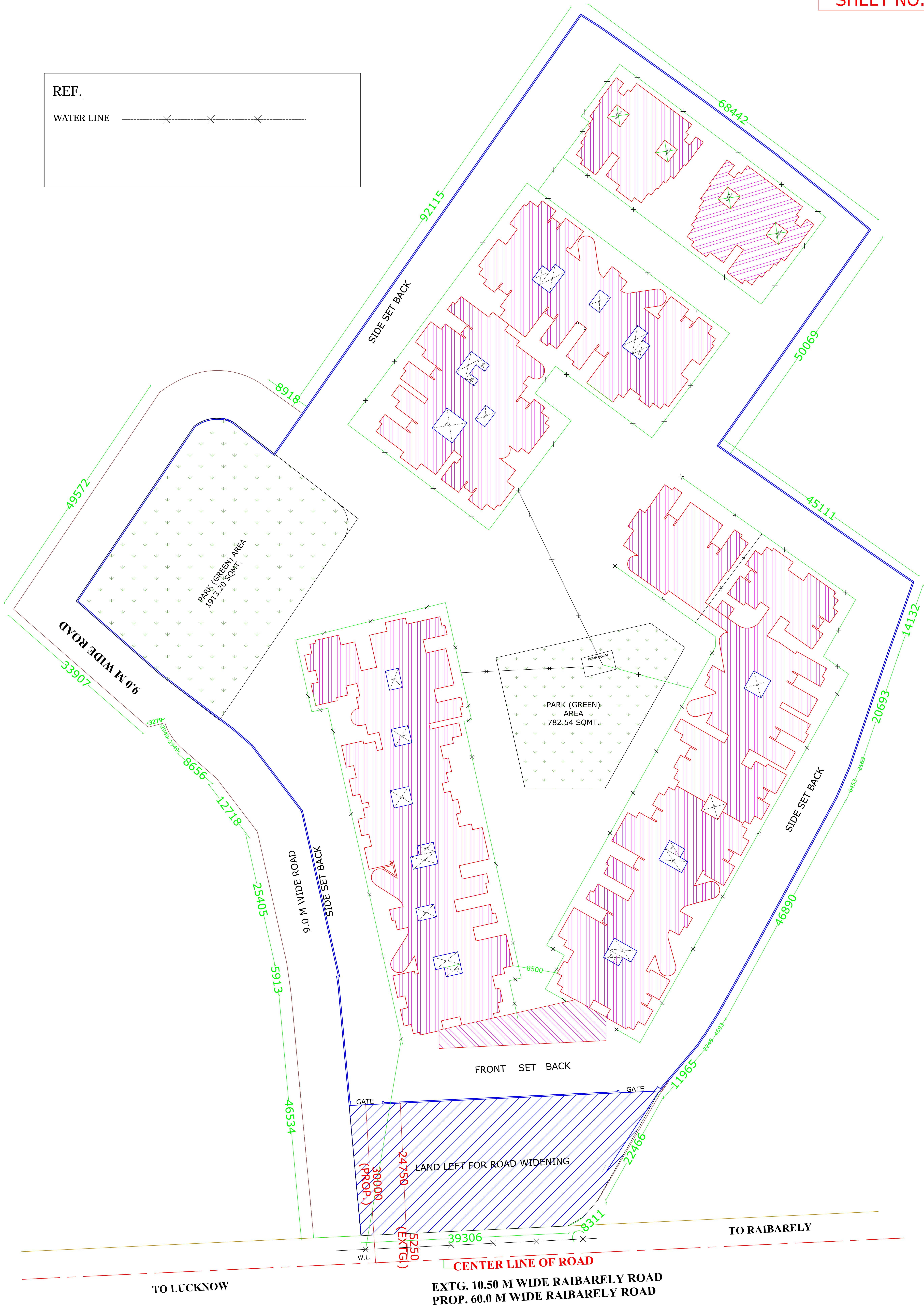
SERVICE PLAN(WATER LINE ) SCALE = 1:200

THIS MAP HAS BEEN PREPARED UNDER MASTER PLAN 2021./BHAWAN UPVIDHI 2008