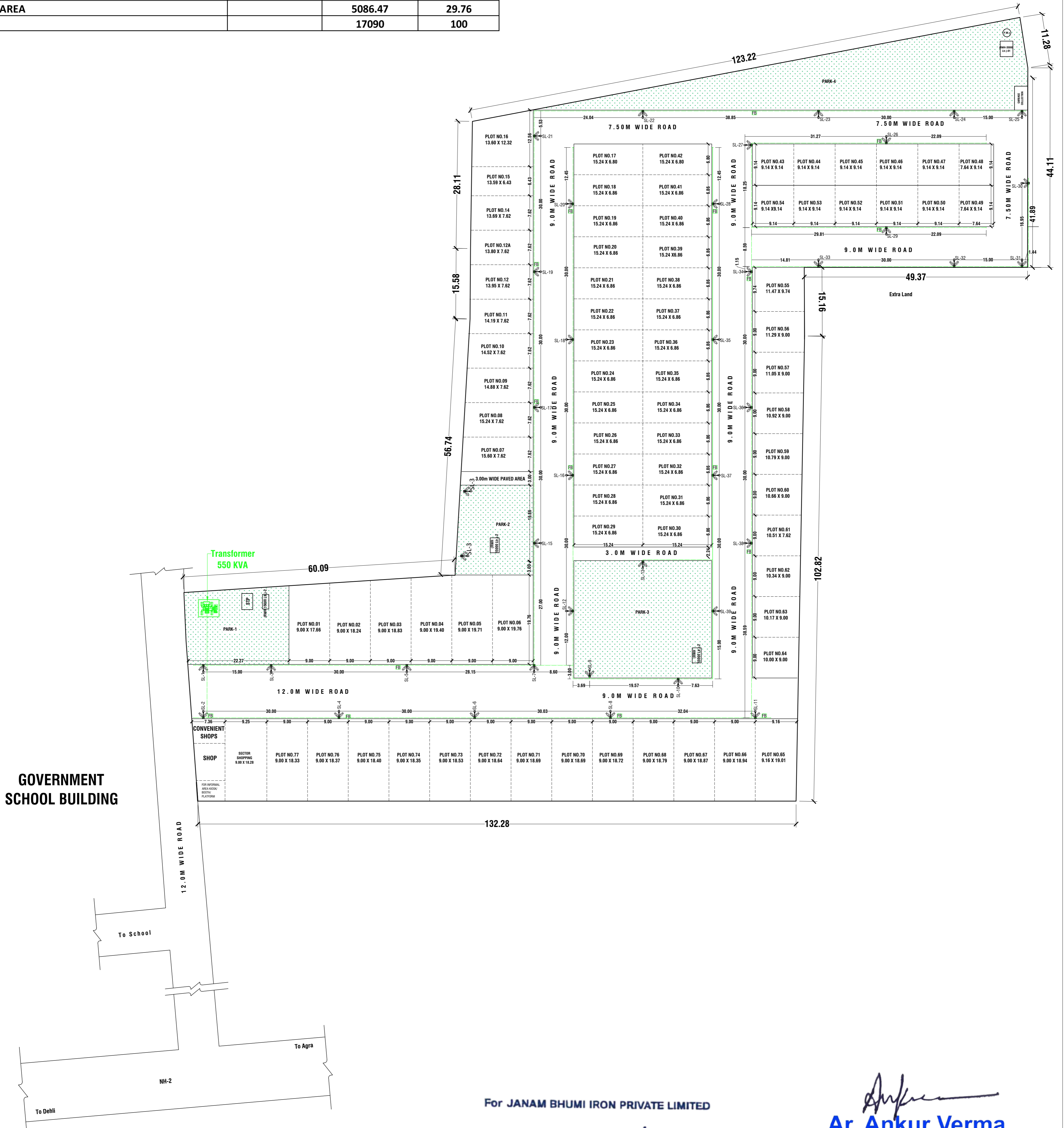
Electrical Layout Plan