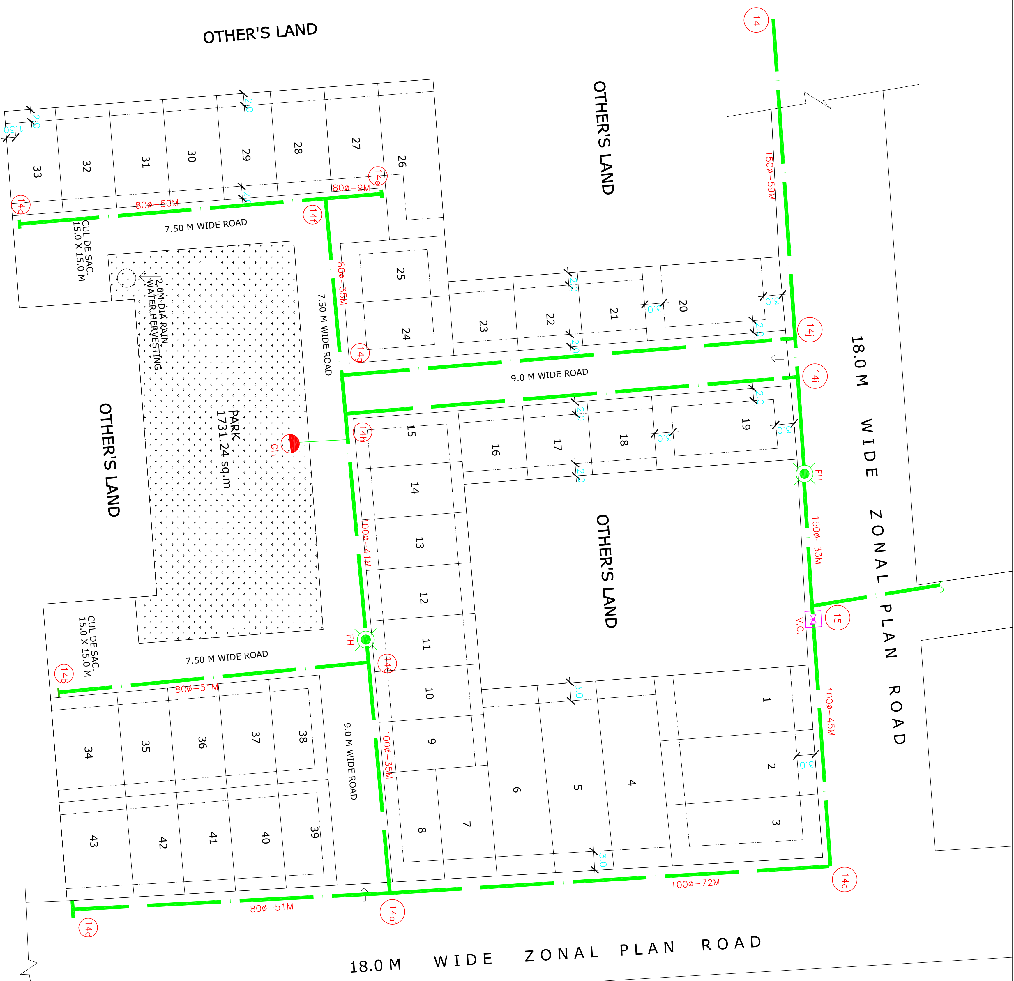
18.0 M WIDE ZONAL PLAN ROAD