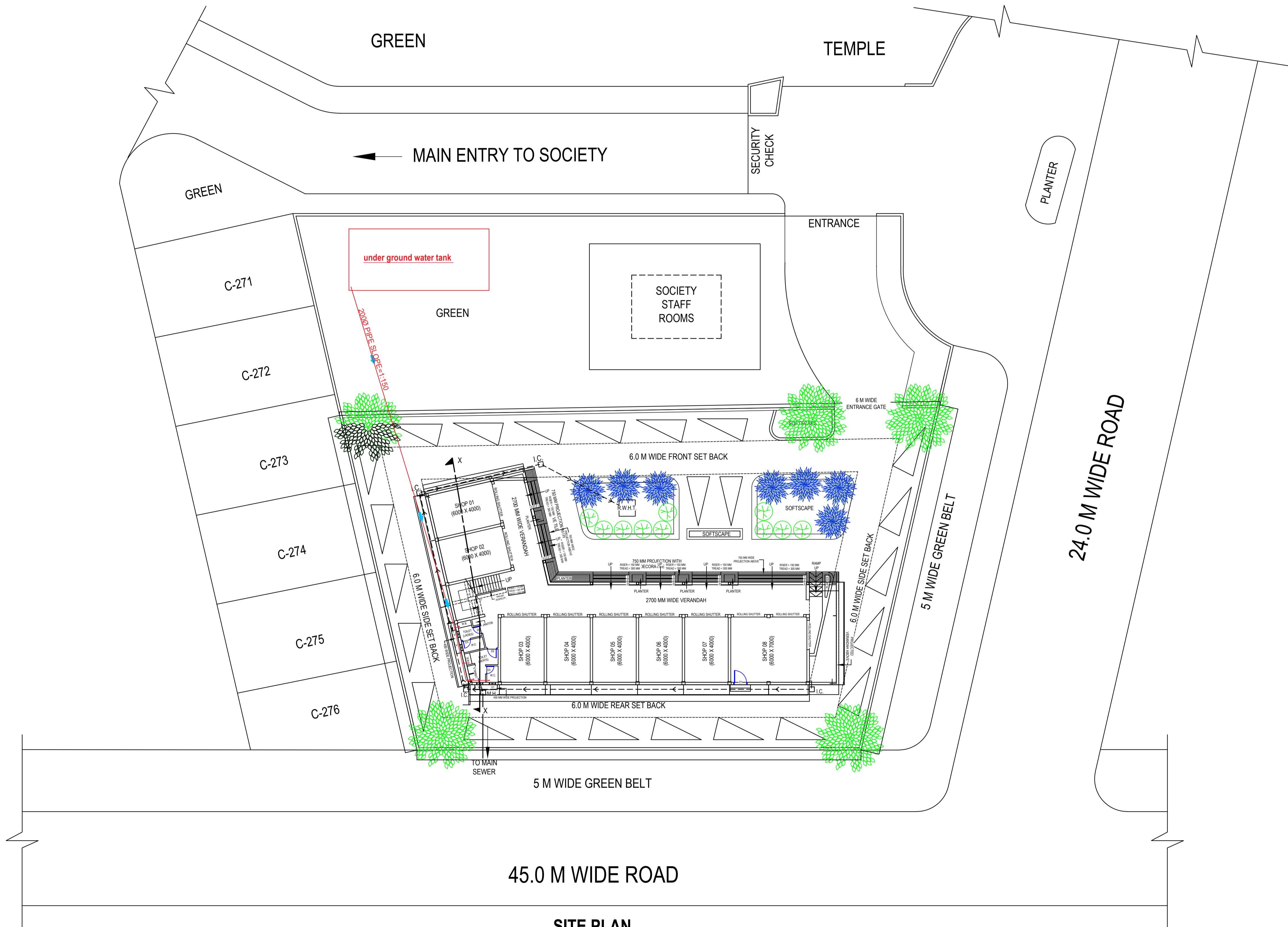
SITE PLAN (SCALE = 1:200)