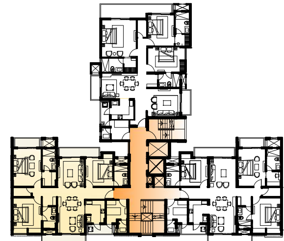
CLUSTER PLAN OF TOWER-G