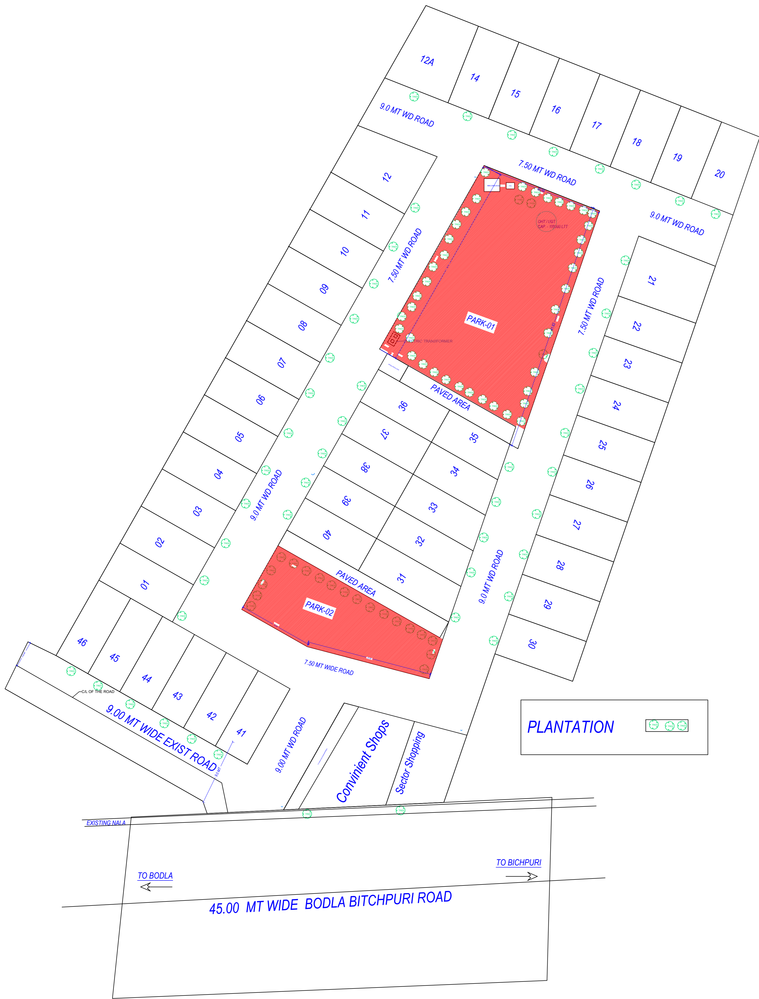
ROAD & PLANTATION PLAN