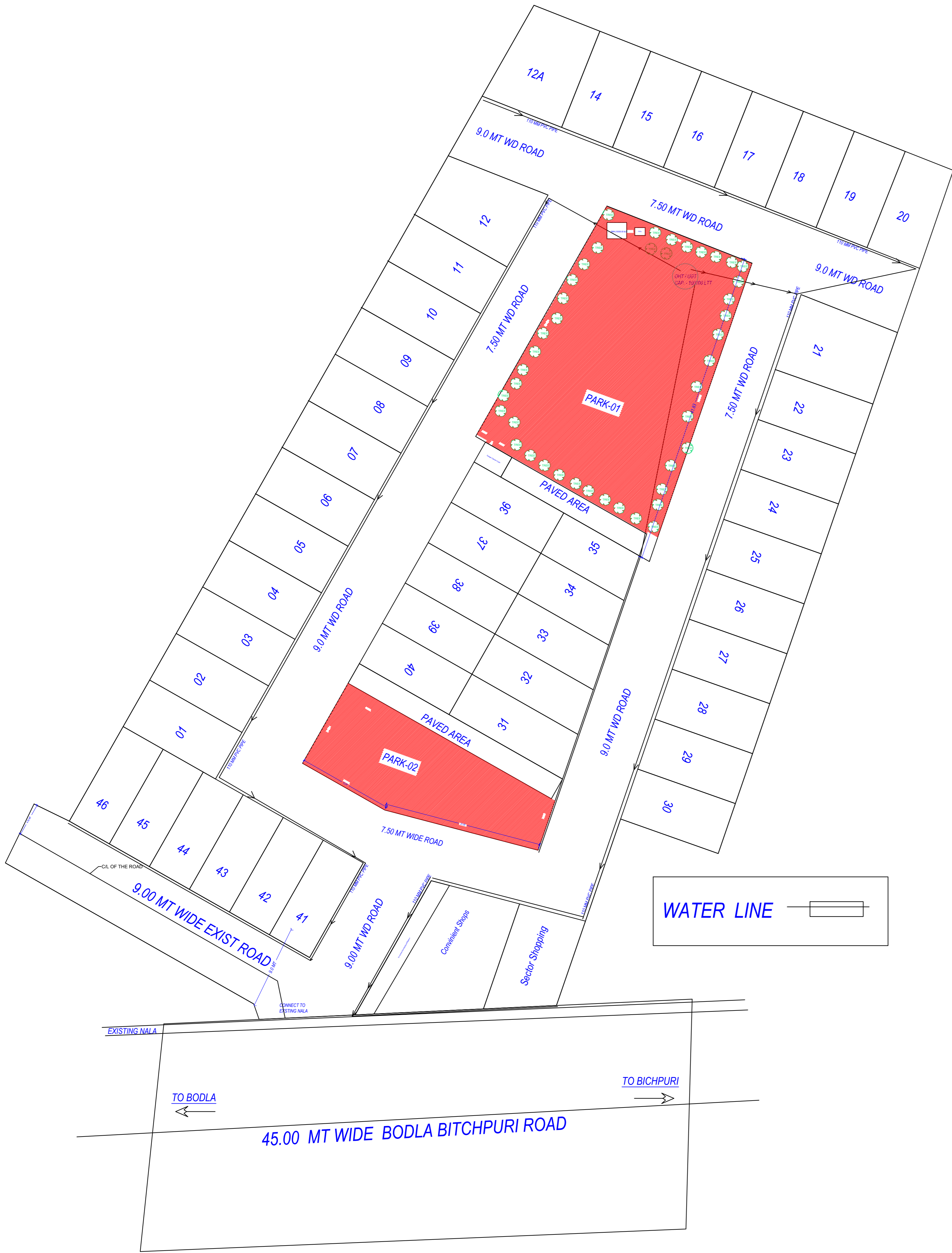
WATER LINE PLAN