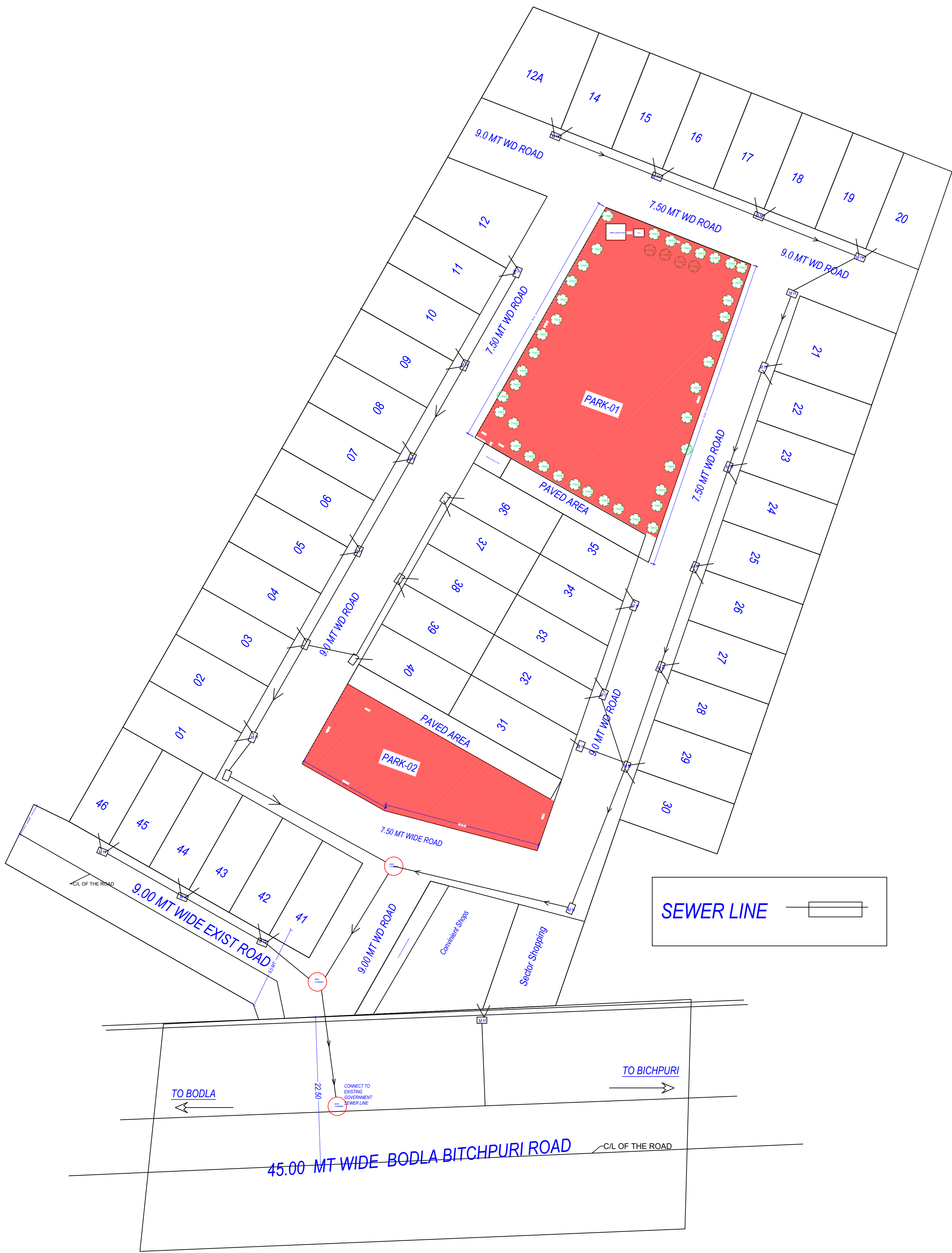
SEWER LINE PLAN