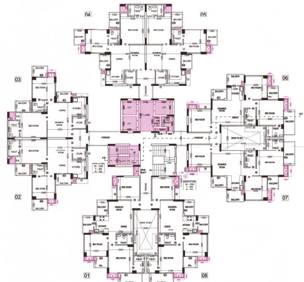
TOWER - E 2nd TO 17th FLOOR PLAN