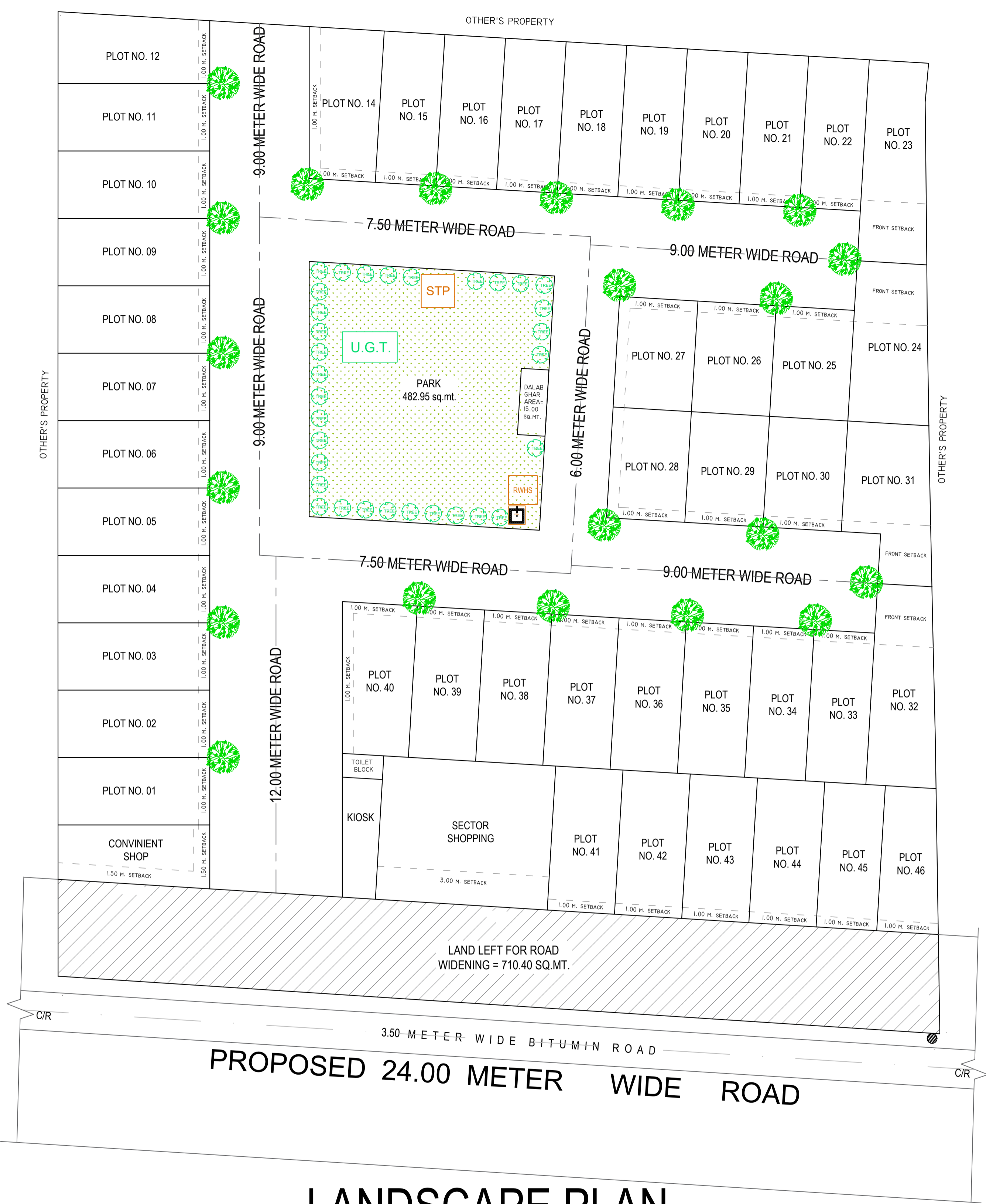
LANDSCAPE PLAN SCALE -1:100