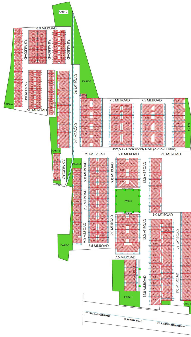
SET BACK PLAN SCALE 1:100