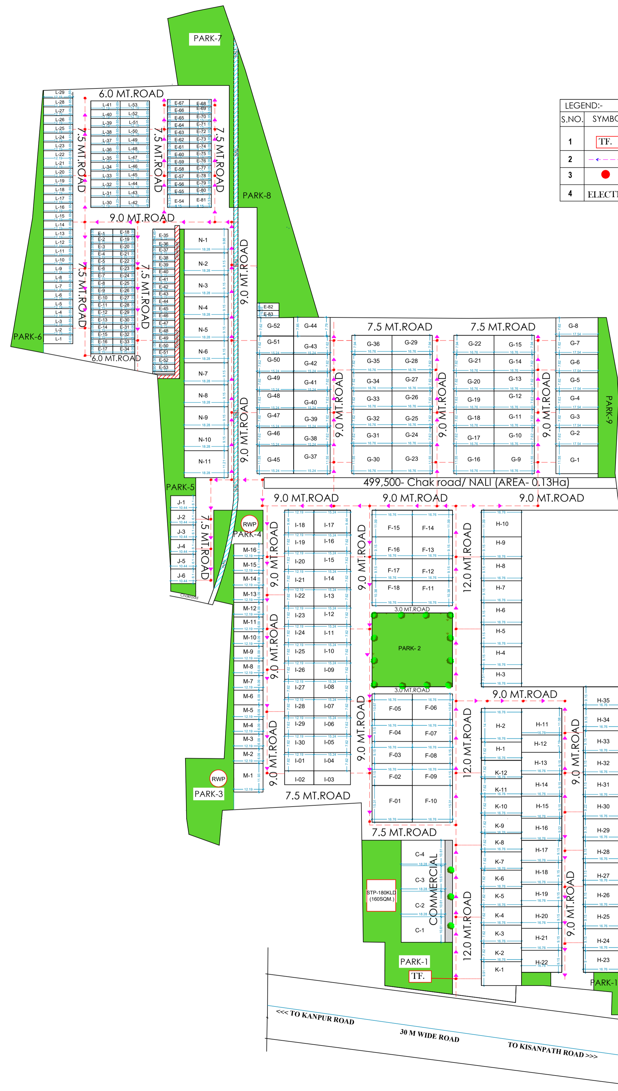
DRAINAGE & Water Supply PLAN SCALE 1:100