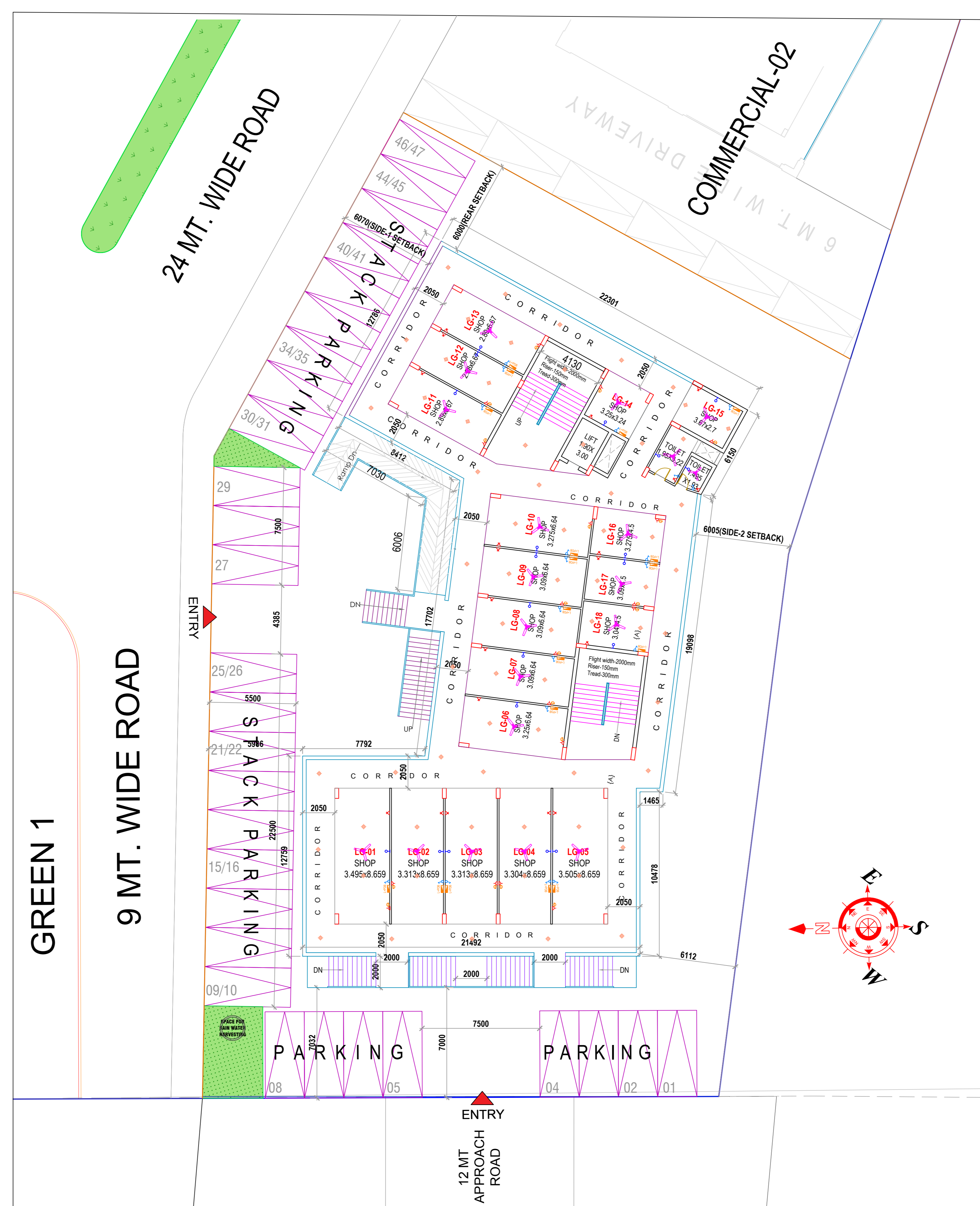
LOWER GROUND FLOOR PLAN (SCALE 1:200)