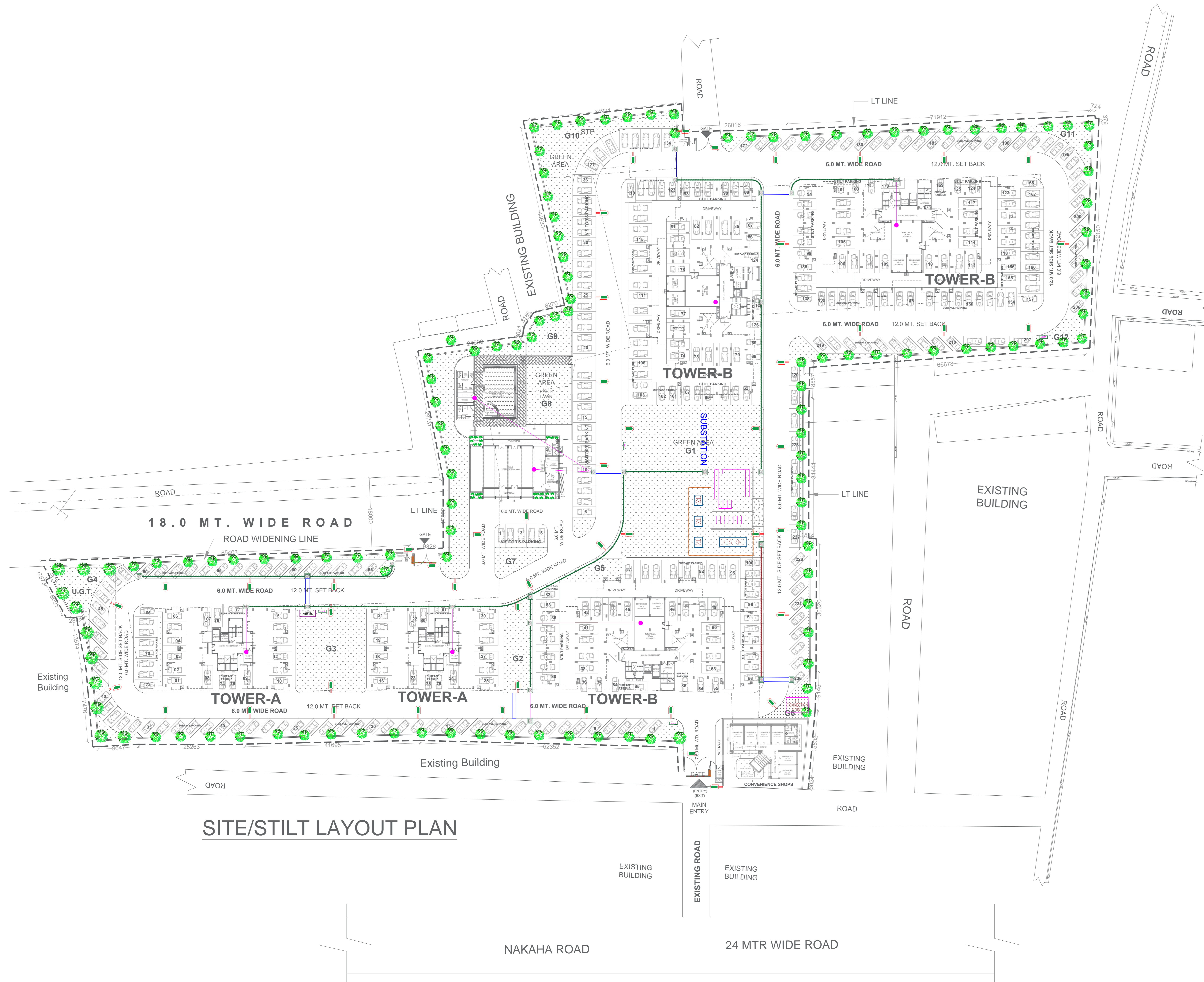
SITE/STILT LAYOUT PLAN