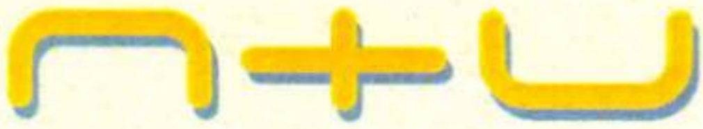
Table - A2