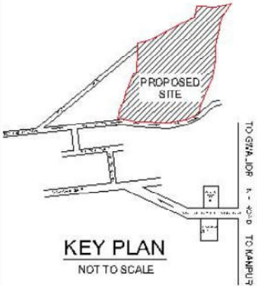
KEY PLAN NOT TO SCALE