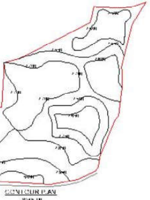
CONTOUR PLAN 304 & 100