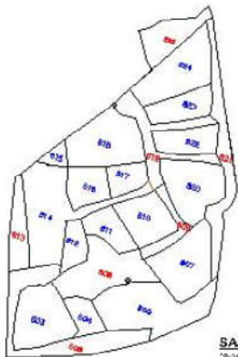
SAJRA PLAN 308 & 1002

ARAZI NUMBER 603,604, 605, 606,607,608,609,610,611,612, 613,614,615,616, 617, 618, 619, 620, 621, 622,623,624 & 625 MAJRA JHANSI KHAS,TEHSIL & DISTT.- JHANSI