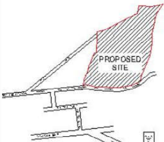
KEY PLAN NOT TO SCALE

ARAZI NUMBER 603,604, 605, 606,607,608,609,610,611,612, 613,614,615,616, 617, 618, 619, 620, 621, 622,623,624 & 625 MAJRA JHANSI KHAS,TEHSIL & DISTT.- JHANSI