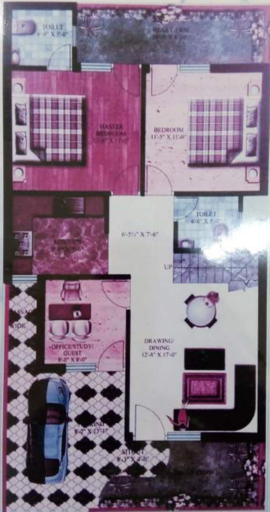
TYPE 'D' EXECUTIVE