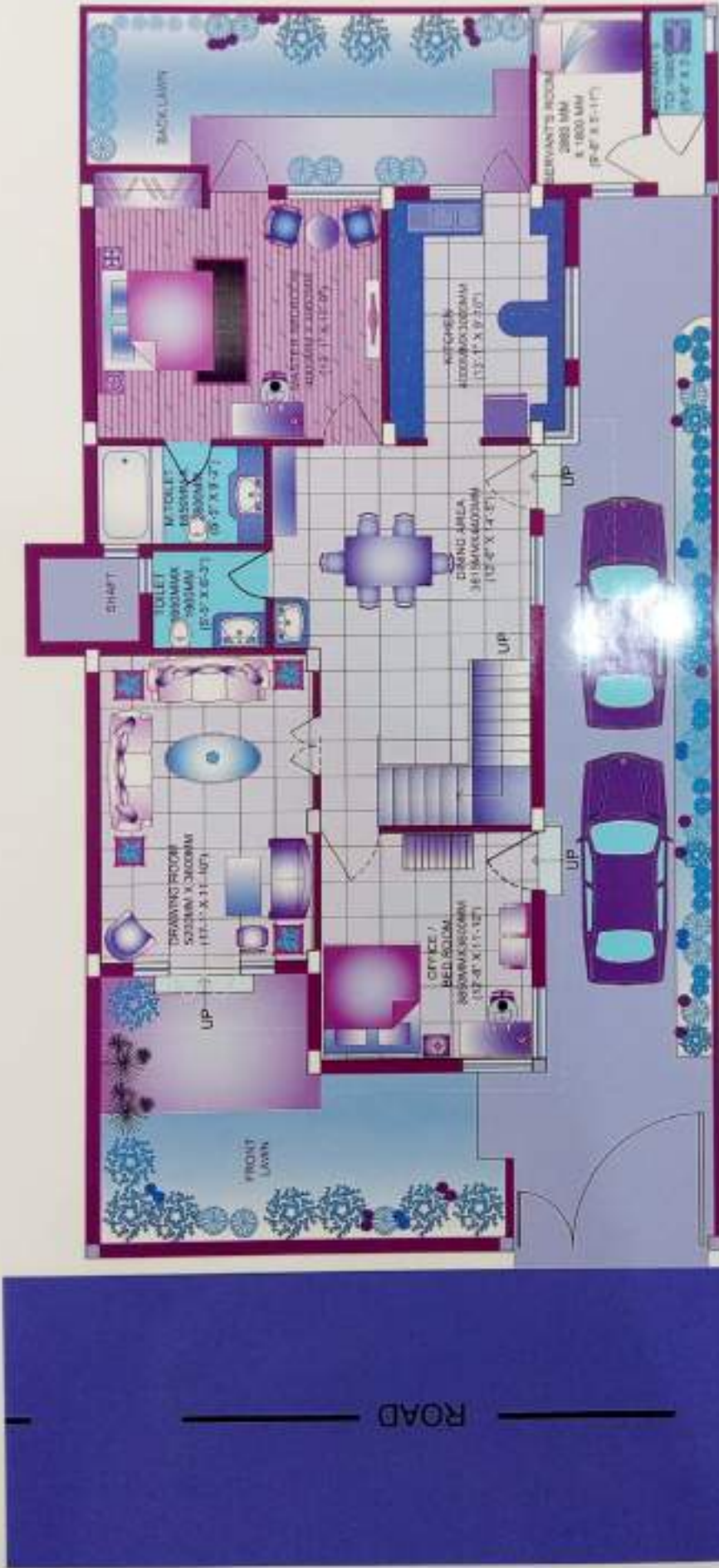
GROUND FLOOR PLAN CARPET AREA = 110.7 SQM (INCLUDING SERVANT ROOM)