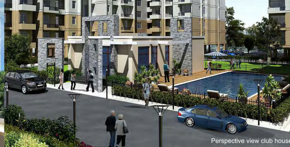
Perspective view club house