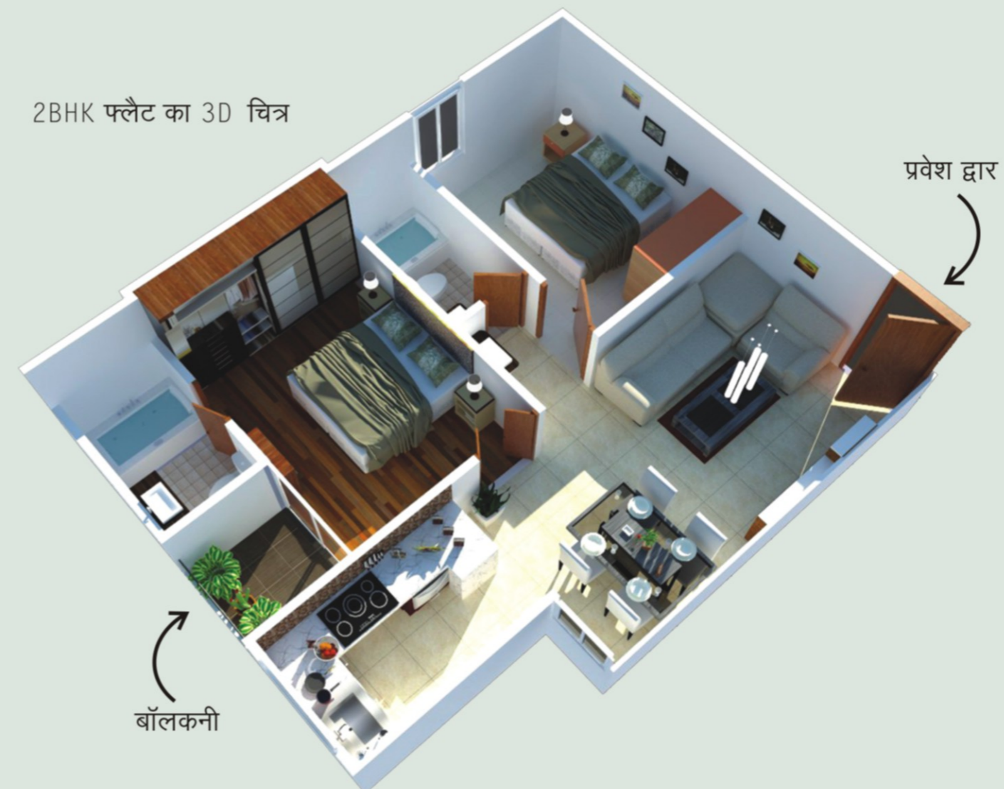
2BHK फ्लैट का 3D चित्र

BUILT UP AREA - 59.76 SQ. MT.* / 643.25 SQ. FT. SUPER BUILT UP AREA - 74.07 SQ. MT.* / 797.00 SQ. FT.