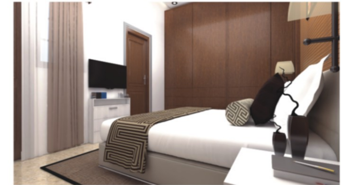
An Artist's impression of a Bed Room

हमारे निर्माण की उच्च गुणवत्ता व सस्ती दरें , आपके एक घर के सपने को बना रहीं हैं अत्यन्त ही आकर्षक व आसान। मात्र 20,70,000/- में 797 वर्ग फुट क्षेत्रफल का यह फ्लैट बनेगा आपकी छोटी सी दुनिया का एक समृद्धिशाली आशियाना।