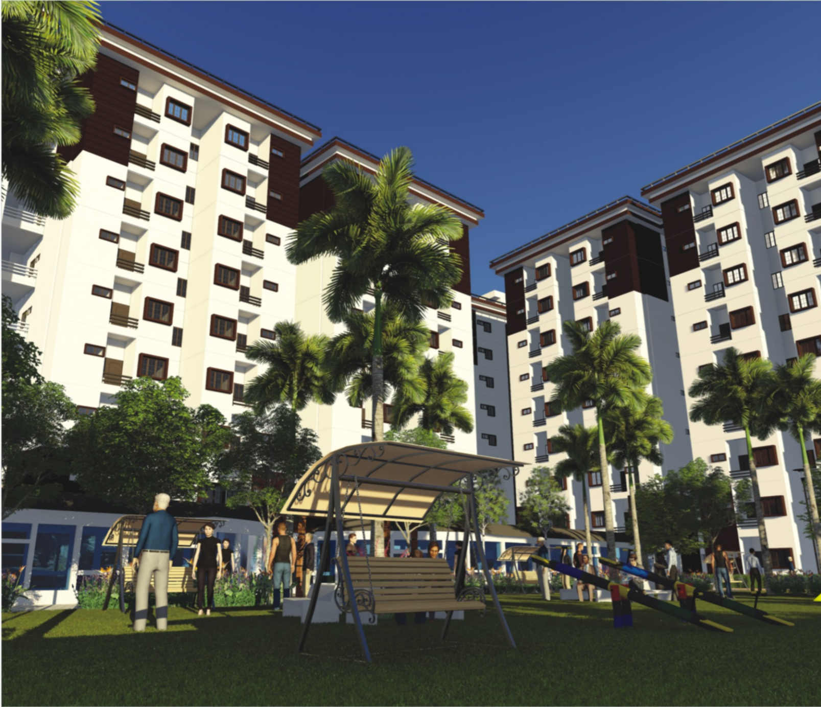
An Artist's impression of Children Playing Area of Park view

लॉन व पार्क: सुबह शाम हरे भरे केन्द्रीय लॉन में फुरसत के पलों में समय बिताने और पार्क में लगे झूलों पर खेलते हुए बच्चे, सोसाइटी के निवासियों के लिए बनेगा एक जीवन्त स्थान।