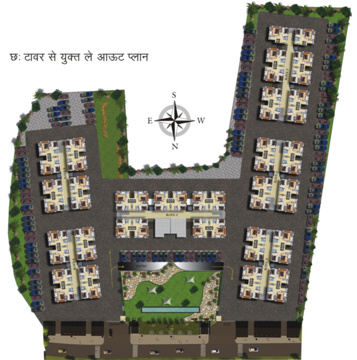
छ: टावर से युक्त ले आऊट प्लान

लॉन व पार्क: सुबह शाम हरे भरे केन्द्रीय लॉन में फुरसत के पलों में समय बिताने और पार्क में लगे झूलों पर खेलते हुए बच्चे, सोसाइटी के निवासियों के लिए बनेगा एक जीवन्त स्थान।