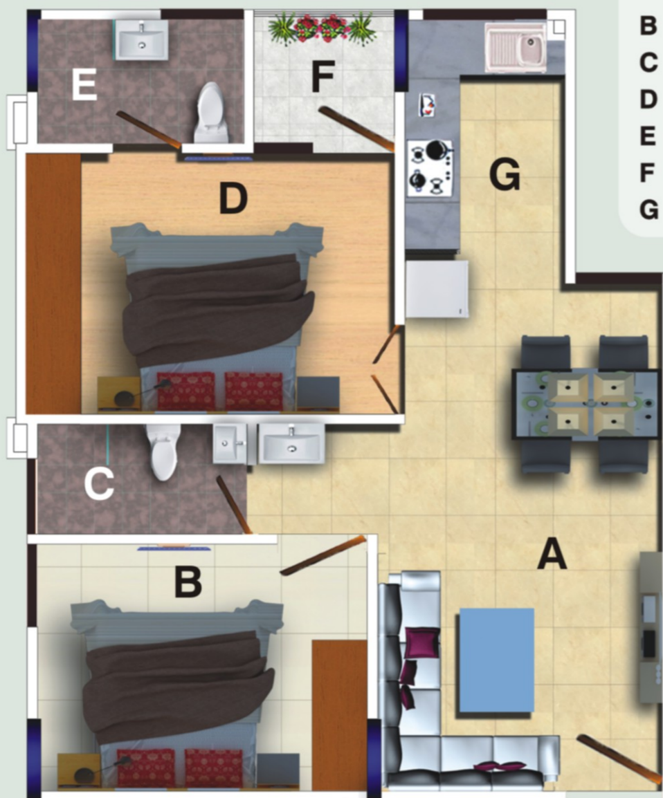
2BHK फ्लैट का प्लान