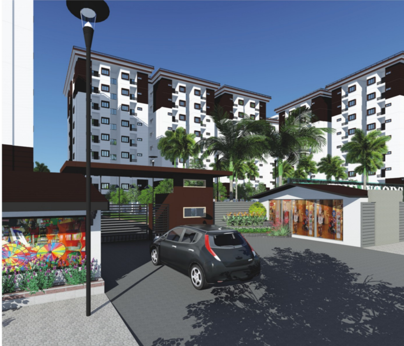
An Artist's impression of Entry Area

24 x 7 सुरक्षा: मेन गेट पर गार्ड, मुख्य स्थानों पर CCTV, व घरों में इण्टरकॉम के द्वारा सोसाइटी की मल्टी लेवल सुरक्षा का प्रबन्ध।