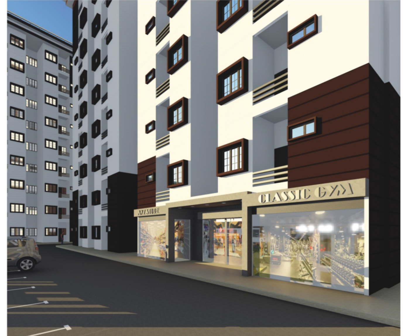
An Artist's impression of Gym and Stores area

प्रांगण में जिम व स्टोर: आपके नित्य स्वास्थ्य प्रक्रिया के अमल हेतु आधुनिक फिटनेस उपकरणों से सुसज्जित एक Gym (व्यायामशाला) व आपकी रोजमर्रा की जरूरतों की आपूर्ति के लिए सोसाइटी प्रांगण में एक स्टोर का प्रावधान।