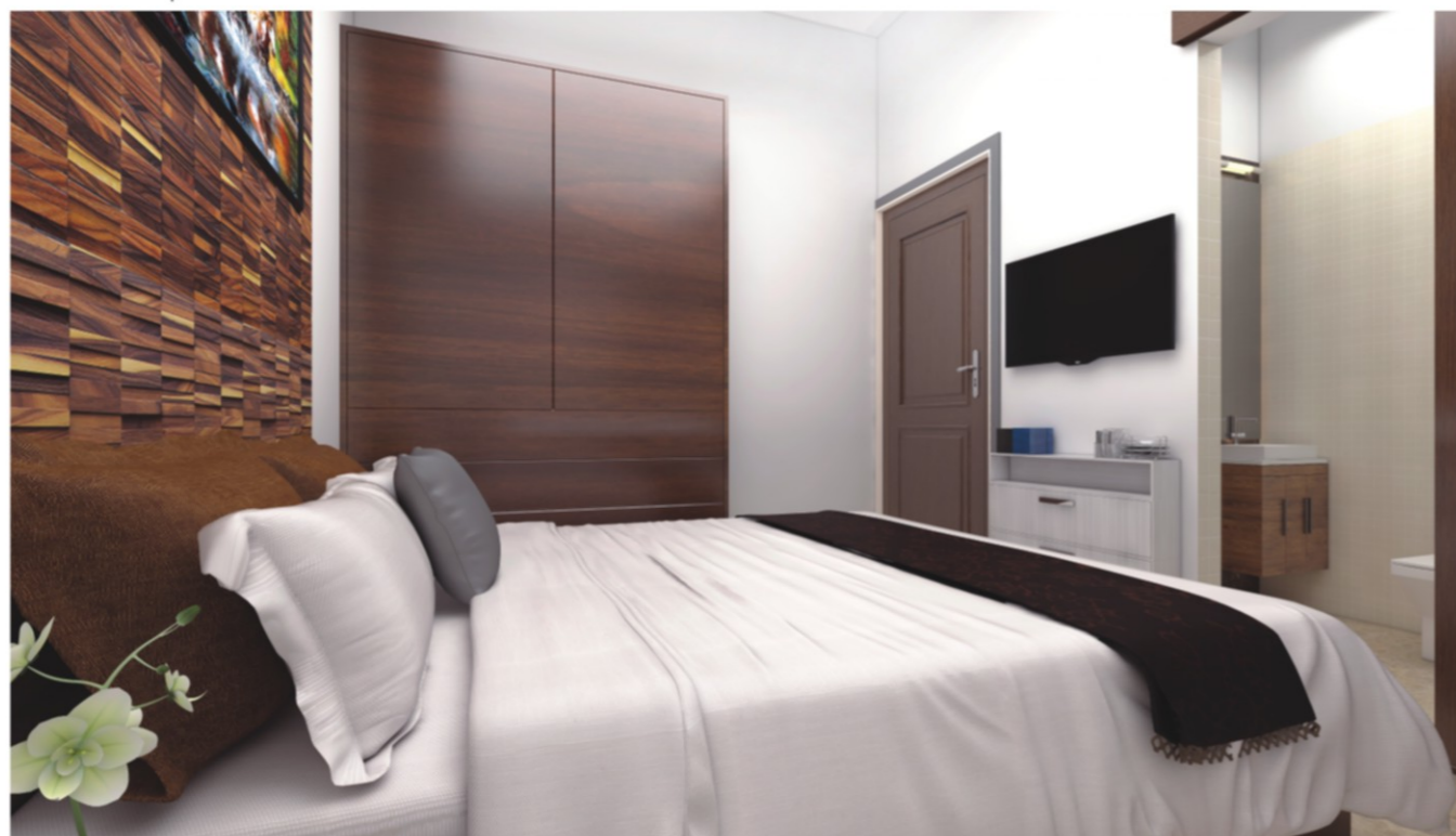
An Artist's impression of Bedroom