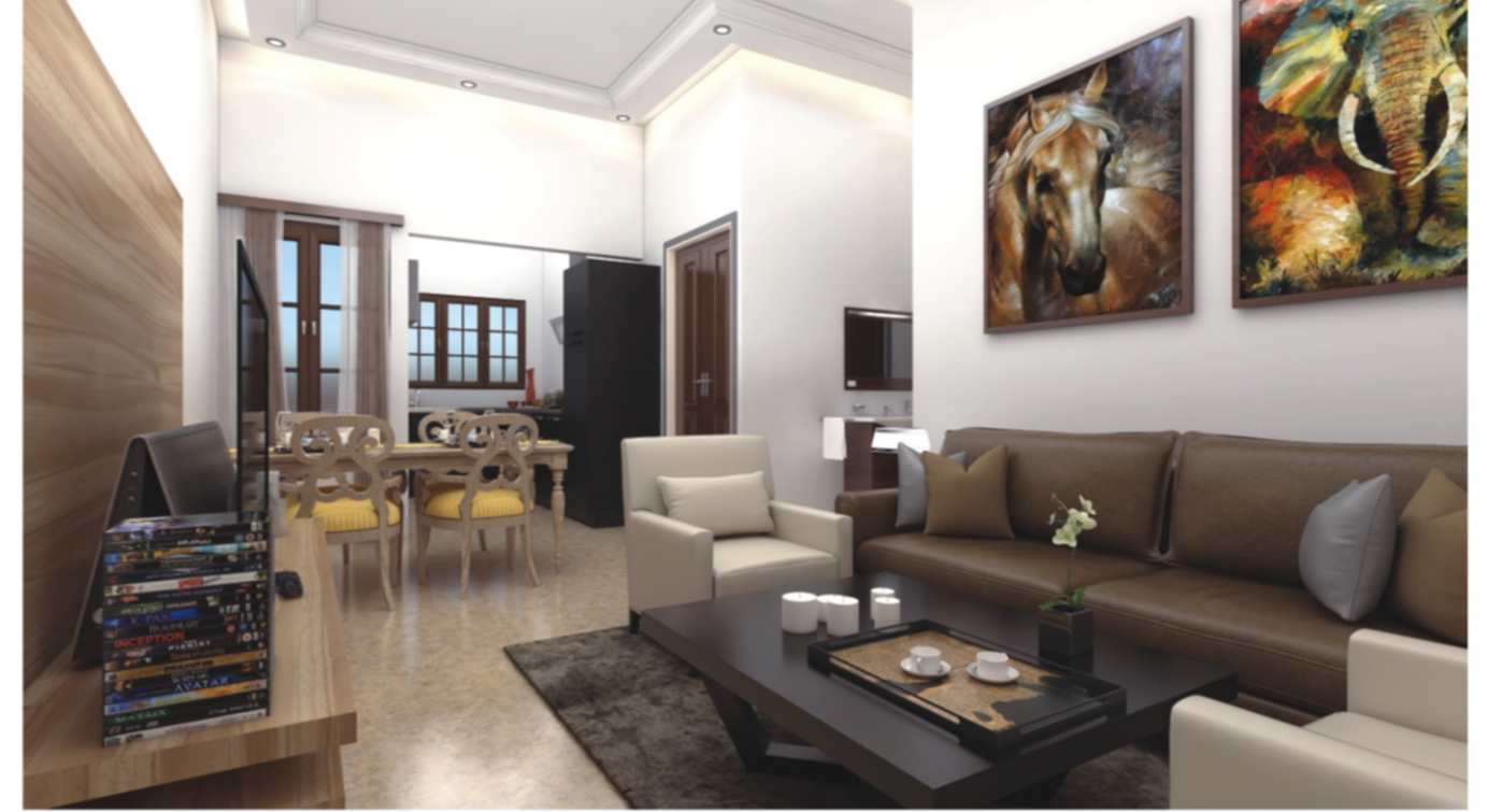
An Artist's impression of Drawing cum Dining

जी हाँ, ये है THE WOODS नौबस्ता , देवा रोड, लखनऊ पर, आपके सपनों का एक शानदार फ्लैट जिसे उत्तर प्रदेश सरकार की समाजवादी आवास योजना के अन्तर्गत, टचवुड इन्फ्रावेन्चर प्राईवेट लिमिटेड अत्यन्त ही सस्ती दरों पर आपके लिए लेकर आए हैं।