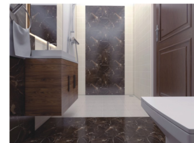
An Artist's impression of Toilet

Similarly all Specifications and designs of the project are final but builder has the sole discretion to change it at a later stage