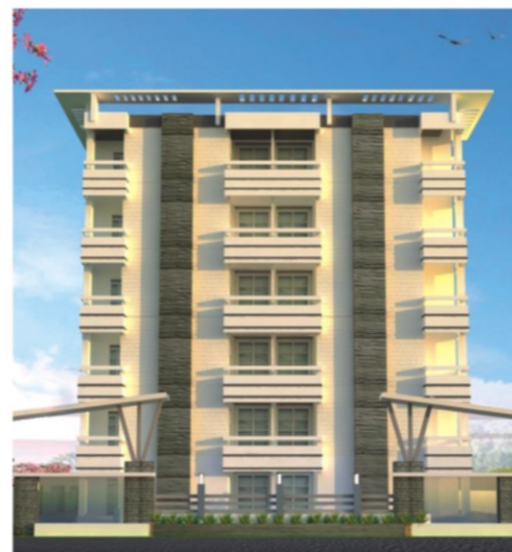
The Raen Basera at New Hyderabad

The other one, WOODS Aishbagh , is an iconic edifice standing tall at Aishbagh making it the poshest of all Locality of Lucknow. Complete with all the modern amenities and highest standards of quality construction, it speaks aloud of our commitments towards our esteemed buyers.