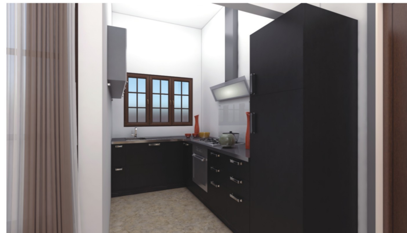
An Artist's impression of Kitchen area

Fittings - CP fittings with mixers Provision for RO System