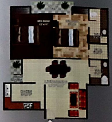
2 BHK Super Bungalow Area - 105.45 sq.mtr. (1135 sq.ft.)